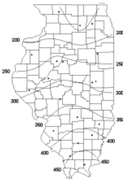
Figure 2. Actual degree-day accumulations (48°F) from January 1 through April 22, 2001.

Here’s another reminder to look for discolored alfalfa weevil larvae when scouting alfalfa fields. Larger larvae that appear yellow probably are in-