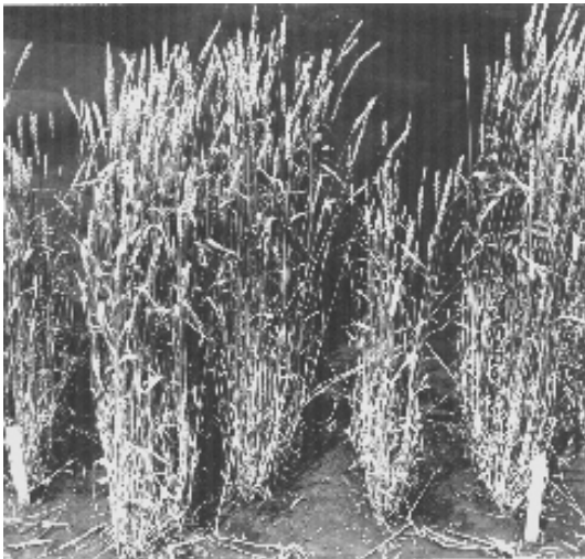
Figure 3. Vermillion wheat dwarfed by BYDV fall infection. Taller rows are healthy

The first symptoms on oats, and to a lesser extent on barley and wheat, are the appearance of faint yellowish green blotches, usually near the leaf tip. The blotches enlarge rather rapidly, merge, and turn various shades of red, purple, brown, or yellow-orange. The yellowish green blotches continue to appear on lower parts of the leaf before they change color. Affected portions often die as the infection spreads through the entire plant. The leaves may curl inward, are flexible, and appear more erect than usual. Symptoms generally appear first on the older leaves. Late-infected plants may develop symptoms only on leaves growing actively at the time of infection. Blasting of florets also occurs; it may involve only a few florets or, if severe, plants may fail to head. Kernels may shrivel and test weight may be reduced.