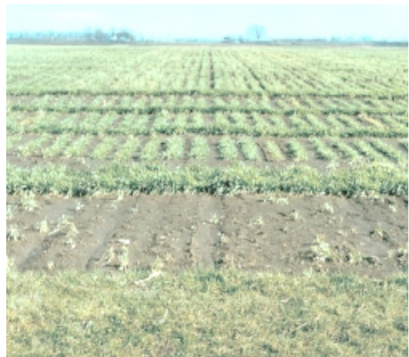
Figure 1. Various stages of yellow dwarf on barley. Test plots at the University of Illinois.

Damage to small grains varies with the cultivar, virus strain, time of infection, and environmental conditions. The severity of BYDV damage depends on plant response. Seedling infection is most severe. Late-planted spring oats and oats growing in poor soils are damaged more severely than those planted early in good soil. Oats following soybeans are less affected than those following corn where no fertilizers have been applied.