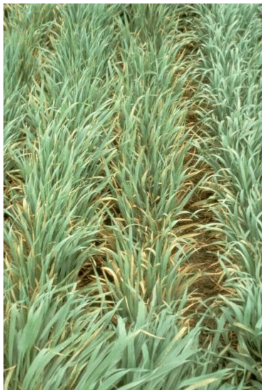
Figure 1. Oat field severely infested with crown rust.

Over a 25-year period in Illinois, the annual loss from crown rust has ranged from a trace to 20 percent of the potential yield. In some years crown rust causes a greater loss in terms of yield and grain quality than any other oat disease. Heavily rusted plants are prone to have extreme water loss from hot dry winds, due to rupturing of plant tissues by the rust pustules. This water stress can result in premature ripening, lower yield, shriveled grain, lower test weight, and lodging.