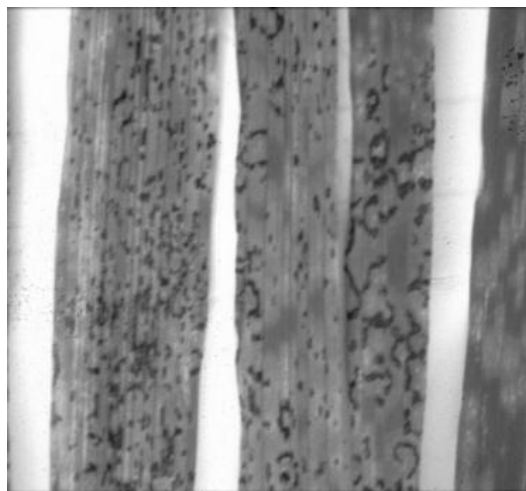
Figure 2. Close-up of crown rust on oat leaves.

As the oat plants begin to ripen, the black overwintering spores (teliospores) are formed in telia (Figure 2). These spores also may form earlier in the season during periods of adverse weather, such as extreme drought, excessive moisture, or very high temperatures. Teliospores, seen under the microscope, have crownlike appendages at their apex and it is this feature that gives the disease its name. The teliospore stage does not rupture the epidermis. The telia are grayish-black to black, oblong, slightly raised, and most abundant on the leaf sheaths. Many telia may be arranged in rings around the pustules of the urediospore stage.