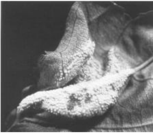
Figure 4. Close-up of 'cluster-cup' stage of crown rust on the underleaf surface of buckthorn.

3C) are formed. Generally, new generations of urediospores reinfect oats until the crop matures and the black teliospores are formed again.