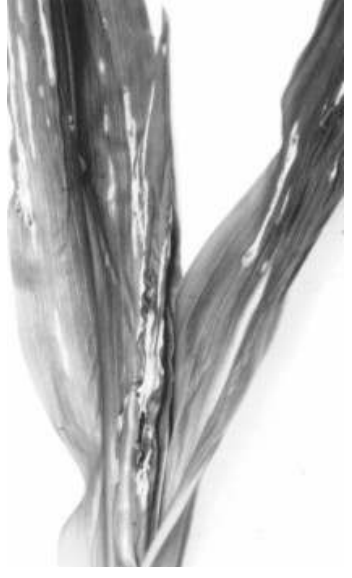
Figure 7. Proliferation of leaflike and husklike structures (phyllody) of a corn ear affected by head smut.

are reddish brown to black, globose to subglobose, abundantly and conspicuously spiny, and 9 to 14 \,\mu m in diameter. Teliospores may germinate in either one of two ways: directly in soil by producing a long dikaryotic (N+N) infection hypha or indirectly by forming a basidium on which lateral sporidia (basidiospores) are borne (Figure 8). The 1-celled sporidia are haploid (N), hyaline, subglosose, and 7 to 15 \mu m in diameter. Sporidia of opposite mating types (+ and -) exist in approximately equal numbers. Seedling infection occurs when sporidia of opposite mating types fuse,