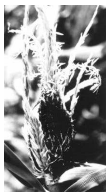
Figure 6. Corn tassel partially covered by a sorus of head smut.

Head smut is not evident until the tassels and ears appear. It is characterized by the presence of sori on the the tassels, ears, or rarely, the leaves. A sorus (plural sori) is a compact mass of dark brown to black spores (teliospores) covered with a thin grayish white membrane which soon ruptures to release a powdery mass of spores which are quickly scattered by air currents and rain. A tangled mass of threadlike strands, vestiges of the vascular system of the corn inflorescence, ramify through the sori and are characteristic of infection by the fungus (Figure 4). The presence of the vascular strands, surrounded by the mass of black-brown spores, distinguishes head smut from common smut. Infected tassels are completely or partially covered by a sorus