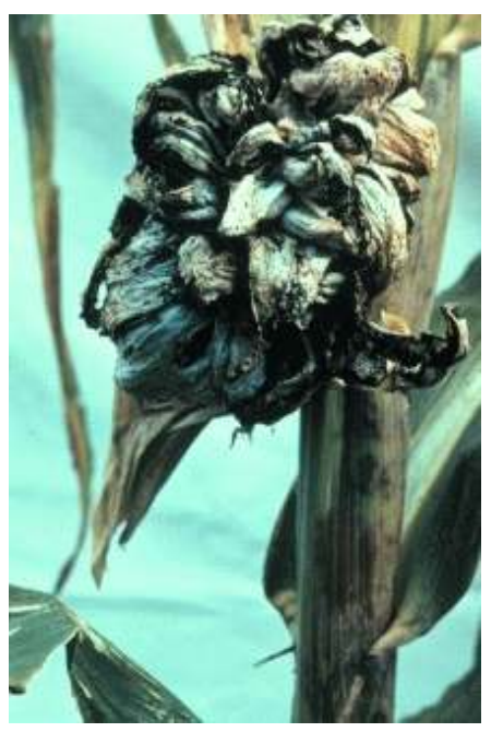
Figure 1. Infection of common corn smut on the ear. Smut galls are covered by the silvery white membrane.

Common smut is well known to all Illinois growers. The fungus attacks only corn-field corn (dent and flint), Indian or ornamental corn, popcorn, and sweet corn-and the closely related teosinte ( Zea mays subsp. mexicana ) but is most destructive to sweet corn. The smut is most prevalent on young, actively growing plants that have been injured by detasseling in seed fields, hail, blowing soil or and particles, insects, "buggy-whipping", and by cultivation or spraying equipment. Corn smut differs from other cereal smuts in that any