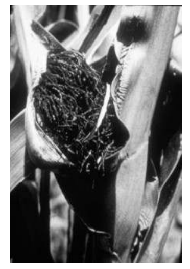
Figure 5. Corn ear destroyed by head smut. Note the tangled mass of threadlike strands (remnants of the vascular system).

grown. The disease has not yet been reported in Illinois. However, Illinois growers should be familiar with this disease and its symptoms because it is present in other corn-growing states in the Midwest. It is more common in drier soils of California, Idaho, New Mexico, Oklahoma, Oregon, Texas, Utah, and Washington. However, it also has been reported in Minnesota, Nebraska, Indiana, Iowa, Kansas, Ohio, and New York. Yield losses result from the replacement of the ear with large smut sori. Replacement of the tassel with sori can seriously affect the efficiency of pollination. Resistant hybrids are known and most field corn is highly tolerant. Sporisorium holcisorghi does not exclusively infect corn. Sorghums, teosinte, pitscalegrass, and Sudangrass also are hosts of the fungus. Pathogenic specialization occurs in the head smut fungus with one group limited to corn and another to grain sorghums, sorgo, forage-sorghum hybrids, and some Sudangrass varieties. A hybrid of S. holci-sorghi has been identified that infects both corn and sorghums.