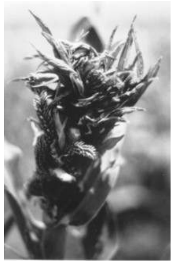
Figure 8. Stripes in corn leaves filled with teliospores of the head smut fungus.

forming a dikaryotic (N+N) germ tube or infection hypha. The parasitic mycelium develops systemically, invading the meristematic tissue of seedlings and later the undifferentiated ear and tassel tissues. Part or all of these tissues develop into smut sori in which teliospores are produced. Teliospores from smutted tassels and ears overwinter in soil and can survive for 3 or more years. High soil moisture and winter soil temperatures above 32^{\circ}F (0°C) lead to decreased survival. Although the teliospores may be seedborne, this is not an important source of inoculum. Teliospores also may be introduced into a field by contaminated harvesting, planting, or cultivation equipment, which transport spores from a diseased to a disease-free field. The infection level is related to low soil moisture (15% to 25% W/w) are optimal for seedling infection. Temperature is more important than soil moisture for infection. Head smut is more prevalent in clay loam soils than in sandy loam or silt loam soils and is accentuated by nitrogen deficiency.