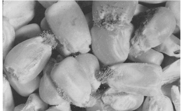
Figure 1. Mold growth ( Aspergillus ) on shelled corn. (Dr. J. Tuite, Purdue University).

The first external symptom is the development of mold on and between the kernels (Figure 1). However, damage may occur within the kernel before external growth or symptoms are visible (Figure 2). The germ or embryo is often killed and discolored (Figure 3). In the case of the common “blue-eye,” the mold is blue. Other molds are bluish green, green, tan, white, black, or pinkish red in color. When storage rots develop, the kernels frequently “cake” together and form a crust, usually at the center and top of a bin. Mold growth is often extensive, and infested bins have a musty odor. Spoilage of the surface grain is often intensified by migration of moisture to the upper layers in bins which lack adequate aeration (Figure 4).