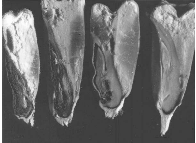
Figure 3. Corn kernels split to show the germ or embryo. Right, sound germ; left, three kernels with germ killed by mold infection (Dr. C.M. Christesen, Univ. of Minnesota).

Ear-rotting fungi are common and destructive in storage when moisture contents are 18 to 20 percent or more. At least one species of Aspergillus can grow slowly on and in corn with a moisture content of 12.5 percent. Other fungi are able to grow at moisture contents of 14, 16, 18, and 20 to 22 percent or higher. However, no one storage mold attacks corn over a wide range of moisture and temperatures. These fungal species work like a “bucket brigade” at a fire. Each fungus works within rather narrow limits. When these limits are reached, another fungus takes over, resulting in a succession of organisms colonizing the grain.