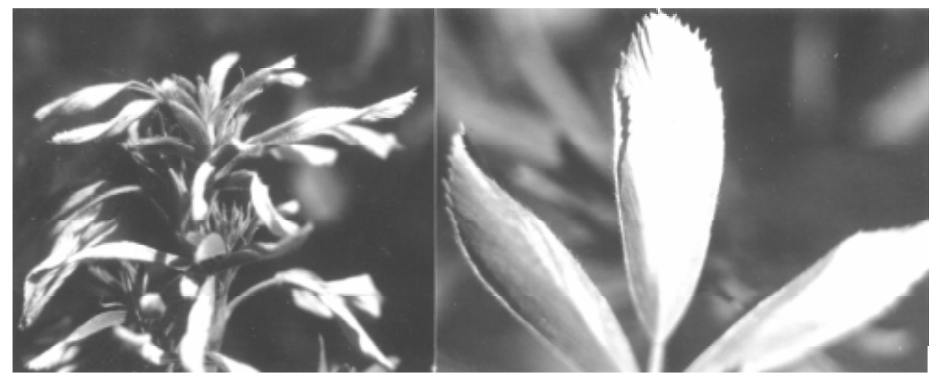
Figure 12. Verticilium wilt: (Left) withered, twisted and yellowed leaves; (Right) close-up of leaf showing typical V-shaped chlorotic areas (Dr. K.T. leath).

Verticillium wilt, caused by the common soilborne fungus Verticillium albo-atrum, is a disease of cool temperate regions throughout the world. It was first reported in the United States in 1977 and in northern Illinois in 1984. The upper leaves of affected plants temporarily droop and wilt on warm summer days. Later, the lower leaves and shoots wilt, become pale, then yellow, and finally bleached and withered