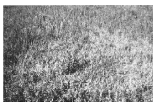
Figure10. Circular patch of alfalfa affected by violet root rot (U. Of Wis. Photo).

turns straw-yellow then brown in enlarging, circular to irregular patches. All or nearly all the plants within a patch die (Figure 10). Affected plants at the margin of a patch are conspicuously when brown compared t o surrounding green healthy plants.