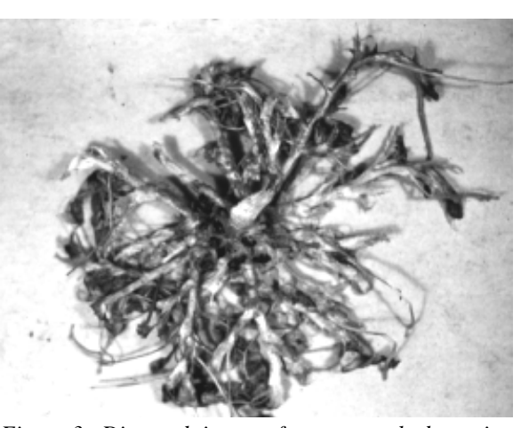
Figure 3. Diseased tissue soft, water-soaked, turning dark; caused by Phytophthora root rot. (Courtesy Dr.

killed-out in the low spots by Phytophthora root rot.