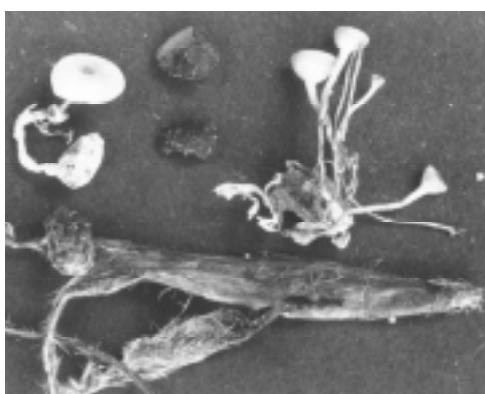
Figure 6. Sclerotia and apothecia of <u>Sclero-</u> tinia sclerotiorum.

Sclerotinia crown and stem rot, caused by the fungus Sclerotinia ( Whetzelinia ) sclerotiorum or trifoliorum , is evident by the small-to-large patches of dead and dying plants in the early spring. Plants of all ages are susceptible. Infected leaves and stems become yellow, wilt, and collapse