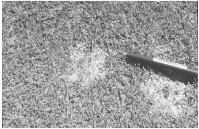
Figure 2. Dollar spot on bentgrass.

the blades of grass on overcast days or early in the morning and the dollar-spot fungi are active, mycelia (a white cobwebby or cottony growth) of the causal fungi may be seen on the diseased turf (Figure 3). Guttation fluid (dew) increases the process of infection. Some mycelia may persist under the leaf sheaths, but most disappear as they are dried by the wind and sun. The mycelia of the dollar spot fungi are often confused with spider webs. Spider webs, however, are in a single plane, whereas dollar spot is three dimensional. When turf is maintained at a higher cut of 1 to 2 1/2 inches, the diseased areas are noticeably more irregular in outline and larger, with some spots four to eight inches in diameter. The spots may coalesce to give diseased turf a drought-stricken appearance.