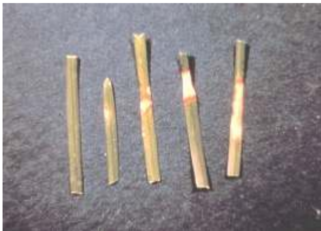
Figure 1. Sclerotinia dollar spot lesions on Kentucky bluegrass.

Dollar spot of turfgrasses is believed to be caused by species of the fungi Lanzia and Moellerodiscus (formerly known as Sclerotinia homoeocarpa ). It has been reported in most areas of the United States. During warm moist weather in the northern part of this country dollar spot is a serious disease of creeping bentgrass, Kentucky bluegrass, annual bluegrass, and fine-leaf fescues. All lawn and fine turfgrasses grown in the Midwest may be attacked. Perennial ryegrass and tall fescue are potential hosts with Bermudagrass and zoysiagrasses the most severely affected southern turfgrasses. The disease occurs during warm (60° to 85°F or 15° to 39°C), humid weather, particularly in turf deficient in nitrogen. Drought stress increases the severity of disease, although leaf wetness within the canopy is also required.