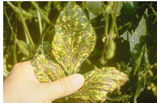
Figure 3. Late leaf symptoms.