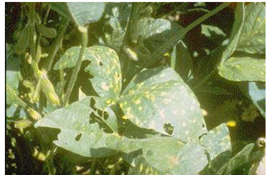
Figure 2. Early leaf symptoms (flecking) on soybean leaves.