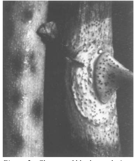
Figure 2. Closeup of black spot lesions on a rose cane (L) and Coniothyrium canker (R). Coniothyrium looks serious, but generally does not develop on wellmatured canes.

Radiating, branching, fungal mycelia develop below the leaf cuticle, producing a black coloration (Figure 3). Depending on the stage of leaf development, resistance of the rose cultivar, temperature, relative humidity, and inoculum density, characteristic black spots are visible within 3 to 16 days. Lesion development is enhanced by the leaves expanding in size (6 to 14 days old), temperatures above 75°F (24°C), high relative humidity, and wet foliage. No infection occurs if the foliage remains dry or if the humidity is below 95 percent.