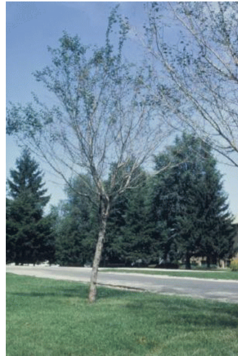
Figure 1. Paul's Scarlet Thorn infected by Leaf spot.

They may be angular to irregular, reddish brown or dark brown, and may have angular or radiating margins. The centers of older spots develop small, raised and rounded dark brown to black fruiting bodies called acervuli, which become grayish white when the spores (conidia) accumulate beneath the cuticle. The lesions on dead or fallen leaves may appear uniformly brown or black.