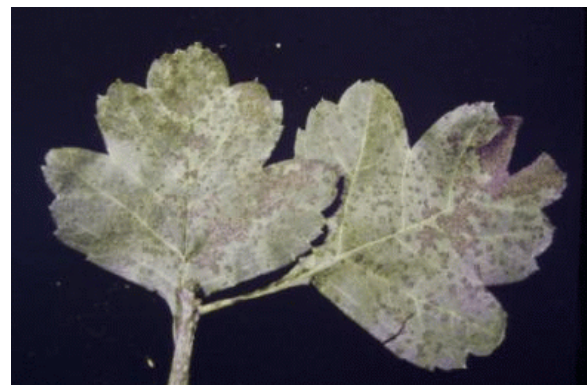
Figure 2. Hawthorn leaf spot. The lesions are reddish brown to dark brown in color.