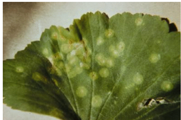
Figure 2. Rust spots (lesions) on the upper leaf surface of a geranium.