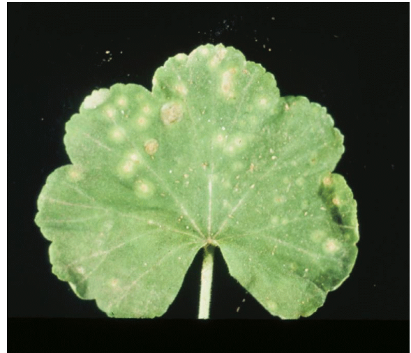
Figure 1. Early stage of geranium rust on upper leaf surface.

The only significant host of geranium rust is P. x hortorum . The disease is most serious on the zonal geraniums, although it has been shown to develop on other species. Rust is usually associated with cutting geraniums, but seedling geraniums ( P. zonale hybrid) are also susceptible. Ivy geranium ( P. peltatum ), Martha Washington or regal ( P. x domesticum ), the scented leaf types, or the wild geraniums are resistant. Geranium rust occurs mainly on the leaves, but occasionally is found on petioles and stems (Figure 1). The disease is favored by relatively cool moist conditions.