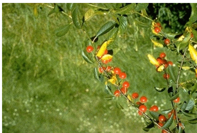
Figure 2. Leaves, particularly on sour cherries, turn bright yellow immediately prior to dropping.

The most conspicuous symptom of leaf spot, especially on sour cherries, is the golden yellowing of older infected leaves before they fall off (Figure 2). Only a few lesions per leaf will result in leaf yellowing and defoliation. Similar spots form on the petioles, pedicels, and fruit causing the fruit to ripen unevenly. Fruit infection may be so severe that the crop is unmarketable.