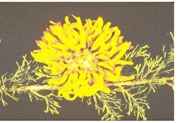
Figure 3. Cedar apple rust gall on Juniper.

On leaves. Pale yellow spots appear on the upper surface of leaves during May and June (Figure 1). The spots gradually enlarge to about 1/4 inch in diameter (1/2 to 3/4 cm) and turn orange, frequently with a reddish border. As many as 300 spots may form on a single apple leaf.