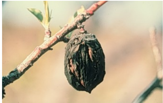
Figure 1. Peach brown rot mummy. Note: infection has progressed into twig.

Brown rot, the most common and destructive disease of stone fruit in Illinois, is caused by the fungus Monilinia (Sclerotinia) fructicola . Brown rot affects peaches, nectarines, plums, prunes, sweet and sour cherries, apricots, almonds, and Japanese quince with nearly equal severity. Ornamental and wild species of the genus Prunus are damaged also. The disease is rare on apples and pears. Brown rot occurs throughout the world wherever stone fruit are grown, being most severe in areas where spring and summer rains are frequent.