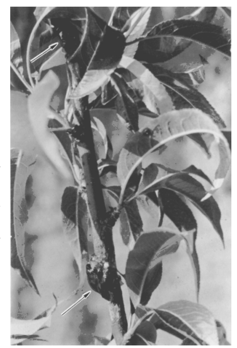
Figure 2. Perennial canker infecting a peach twig. The arrows point to masses of gum.