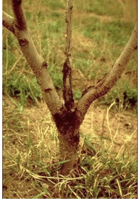
Figure 1. Perennial canker infecting a peach

The disease is often destructive in young orchards where it causes the premature death of trees. Older trees that are affected gradually lose productivity and longevity.