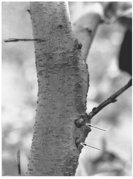
Figure 3. Initial stage of perennial canker on a scaffold limb of peach. Note the gum masses at the base of the dead twig.