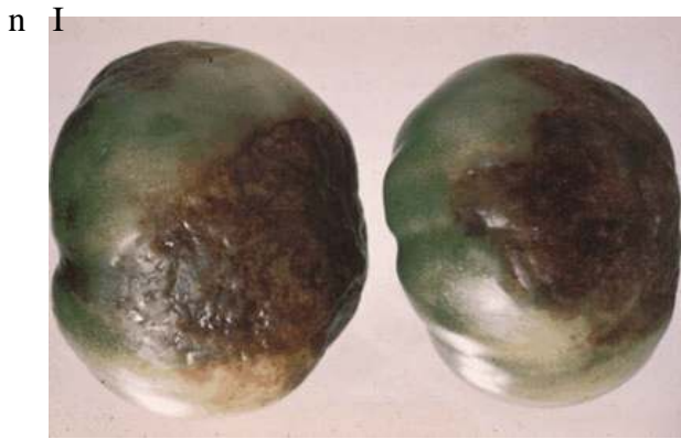
Figure 2. Late blight attacks both green and ripe fruit. Rotted areas are firm but slightly wrinkled and dark green, brown, or brownish black.

In moist weather, the late blight fungus produces a white, downy mildew mostly on the underside of the leaf lesions and on the surface of affected fruit. The mildew growth is composed of spore-bearing structures (sporangiophores) which bear lemon-shaped spores called sporangia (Figures 3a and b).