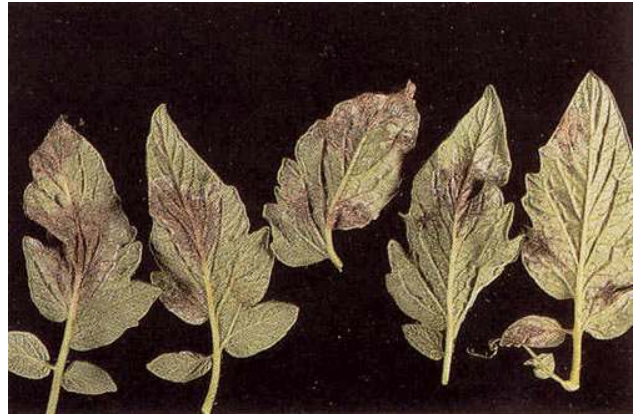
Figure 1. Late blight first appears as water-soaked, greenish black areas on leaves and stems that later turn brown. Often a pale green band surrounds the affected area on the leaf.

These two diseases may be widespread and destructive in Illinois during wet seasons when the foliage and fruit are not protected by fungicides. In cool, moist weather the vines and fruit rot very rapidly from late blight. During prolonged warm, wet weather a large percentage of the tomato fruit in contact with the soil may be affected by buckeye rot.