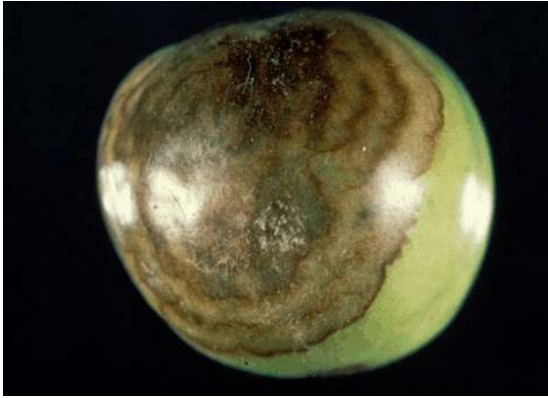
Figure 4. Buckeye rot.