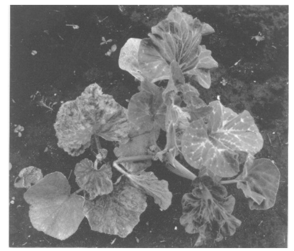
Figure 3. Squash plant dwarfed by squash mosaic virus (SqMV).

Squash mosaic virus is much less common than cucumber mosaic virus. SqMV affects most cucurbits; however, most isolates or strains do not affect watermelon. Other plants infected by SqMV include garden and sweet peas, coriander, and salad chervil. SqMV may cause considerable loss in late-season squash and muskmelon crops. Various SqMV isolates can be divided into two groups based on serology. Group I infects watermelon, causes severe symptoms on muskmelon but only mild symptoms on pumpkins. Group II does not infect watermelon, produces only mild symptoms on muskmelon, and causes severe symptoms on pumpkins.