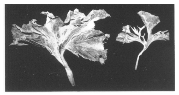
Figure 4. Severe malformation of two pumpkin leaves caused by watermelon mosaic virus (WMV-1).

Watermelon mosaic virus is primarily a problem in the southern and western states. Synonyms of WMV include cantaloupe and melon mosaic and yellow watermelon mosaic. There are at least two strains of