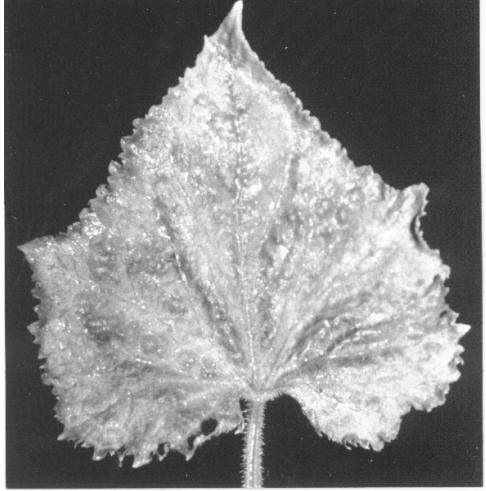
Cucumber leaf distorted by

Primary disease cycles usually start with the virus carried from reservoir hosts to cucurbit plants often from a considerable Figure 6. distance. Secondary disease cycles develop when aphids transmit watermelon mosaic virus 1 (WMV-1). the virus to healthy plants from plants infected during the primary cycle.