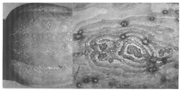
occurs in dandelion, globe-amaranth, lettuce, Figure 7. Tobacco ringspot virus (TRSV). Affected pumpkin petunia, soybean, and tobacco. The nematode fruit (right); close-up of ringspot on squash fruit (left) (courtesy vector is known to retain the virus and remain Purdue University).

TRSV survives between cucurbit plantings in numerous crop, weed, and wild host plants (Table 2), in infected seed, and possibly in a common dagger nematode ( Xiphinema americanum ) vector. Seed transmission is rare in cantaloupe, cucumber and muskmelon. It has been detected in up to 2.5 percent of butternut squash seed from infected plants, but has not been detected in other cucurbit seed. Seed transmission, however, occurs in dandelion, globe-amaranth, lettuce, petunia, soybean, and tobacco. The nematode vector is known to retain the virus and remain viruliferous for up to 49 weeks at 50°F (10°C).