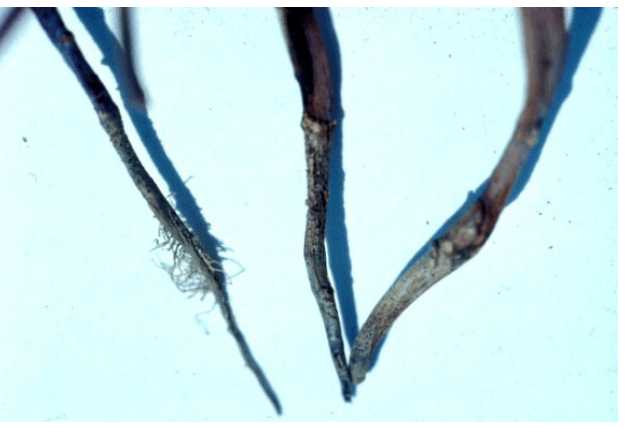
Figure 1. Pale gray lesions causing seedlings to die early.

occasionally immune crucifers include ball-mustard,