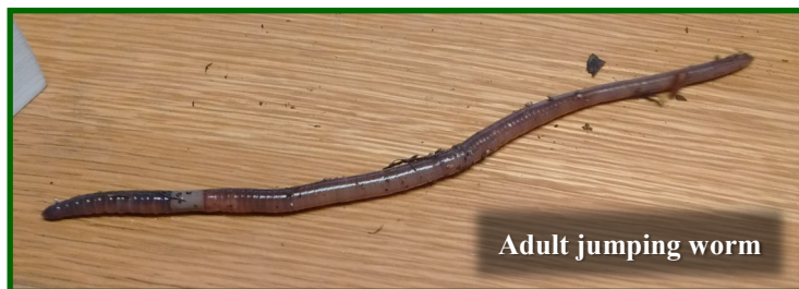
Adult jumping worm

There are concerns about the effects these worms will have on forests and other natural areas as well as agricultural and landscaped areas. Populations of jumping worms have the potential to change the soil structure, deplete available nutrients, damage plant roots, and alter water holding capacity of the soil.