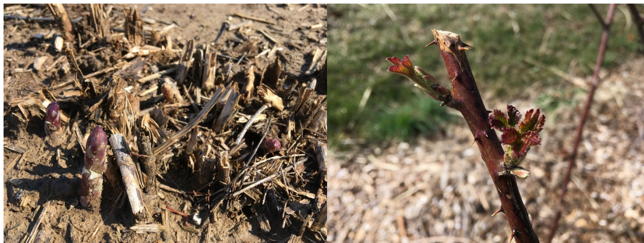
Asparagus emergence starting (left) and first growth on blackberries in southern Illinois.