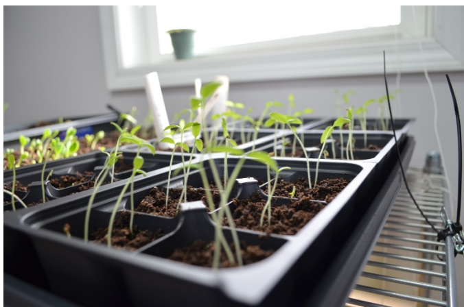
Summer vegetables are getting their start indoors. It seems indoor supplemental light is always in demand. My seed starting setup is no exception with limited space under the lamps.

The basics of the I-Tick Program: People working outside on a regular basis may encounter ticks. I-Tick is asking people who work outdoors throughout the state to join the I-TICK network to help build a more complete record of where and when people encounter ticks within Illinois. Participants agree to keep a record for five days about the ticks that they find on themselves during their work and to submit tick specimens to a hub (local Extension office) near them. Specimens will be picked up or mailed from the hubs to I-TICK representatives for species identification. I-Tick provides a kit with everything needed to keep track of the ticks observed.