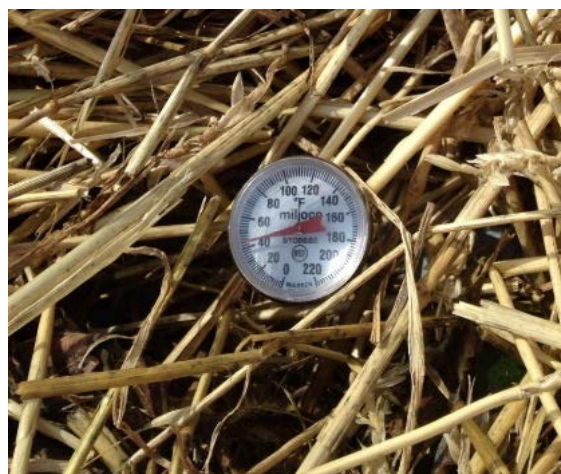
Soil temperatures under straw mulch on strawberries.

Straw removal for strawberry plantings should be done at 41-42 degree soil temperature, based on research conducted at the U of I. Too early and you run a higher risk of late frost injuring the berries, remove the straw late and the plant will begin to grow under the straw. This winter we had a low of -10, so we are expecting a higher amount of leaf desiccation. We try and remove as much dead leaf tissue as possible to reduce incidence of leaf disease.