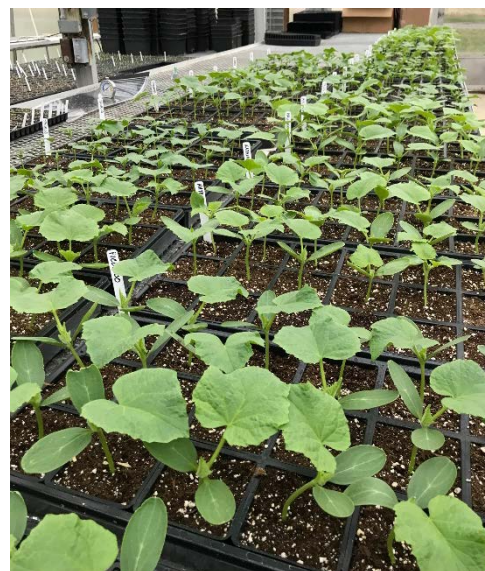
Cucumber transplants off and growing for a cucumber variety trial in the high tunnels.

The propane heater in the greenhouse had to be replaced due to a cracked heat exchanger. Besides creating a horrific noise and being less efficient, this also created a situation that was releasing several pollutants, including carbon monoxide and nitrous oxide, into the greenhouse. This is unsafe for both people and plants. As a reminder to those running heaters, make sure equipment is in good operating condition and being correctly vented outside of the structure to avoid hazardous situations to yourself, employees, or your plants.