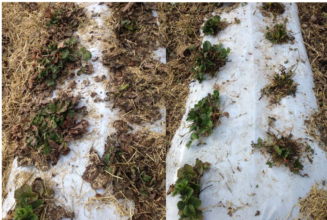
Plasticulture strawberries before (left) and after (right) cleanup of dead leaves after winter. Removal of the dead leaves helps to reduce botrytis.

The plasticulture strawberries (under 1.5 ounce covers) look to have lost 60% or more of leaf area due to winter desiccation. As stated above, we remove as much dead leaf as possible to reduce disease issues. Done by hand, this can take considerable time.