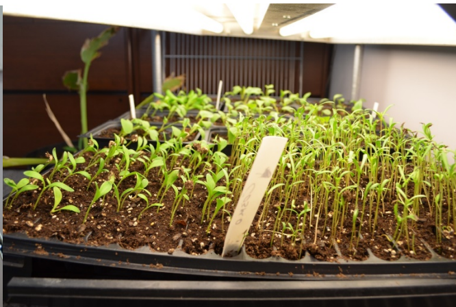
Flowers (marigolds & cosmos) hog the light along with some flats of salad greens and rhubarb seedlings. The greens are being hardened off during the day and after transplanting outside will soon be replaced by flats of tomato and pepper seedlings.

Chris Enroth (309-837-3939; cenroth@illinois.edu )