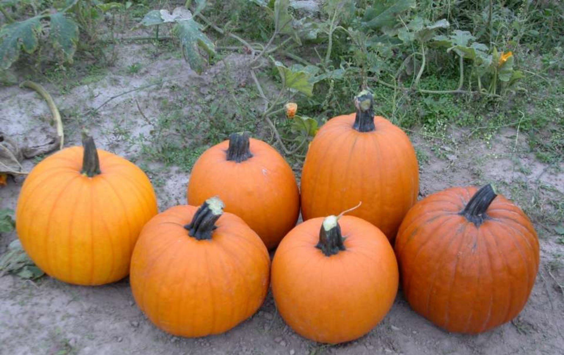
Jack-o-lantern types: Color variation from light orange to dark orange