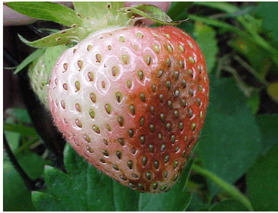
Left: An eastern flower thrips next to an anther in a strawberry blossom. Right: A thrips-damaged strawberry.

A hard freeze warning went out for most of the state this past weekend, but fortunately temperatures stayed above 30 degrees F for most of the southern region, with no reports of injury so far. I spoke with one grower in the Rockford area (far northern IL) who had experienced temperatures hovering around 25 degrees F, but no frost due to wind movement. For peaches, fruit has set and shucks are off in the southern-most portions of the state. Apples range from full bloom to fruit set, and fruit thinning has started. These are some of the temperatures I recorded throughout the southern and into the central region at 5:00 am on Sunday, April 24.