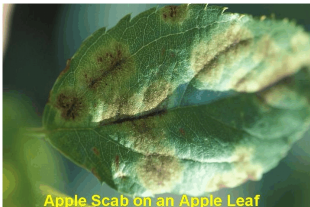
Apple Scab on an Apple Leaf