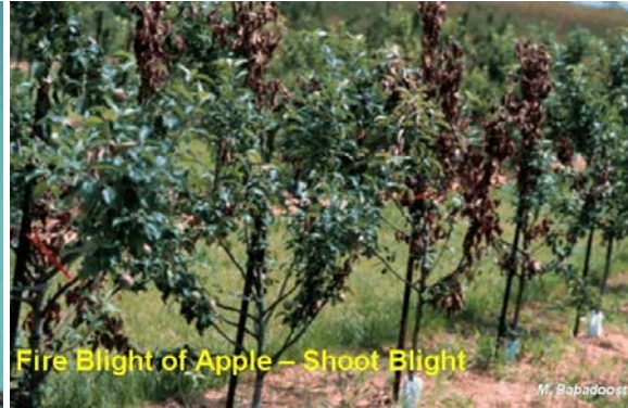
Fire Blight of Apple – Shoot Blight