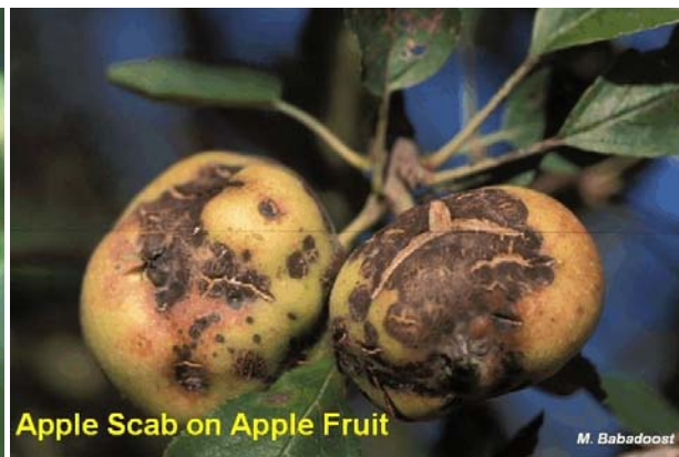
Apple Scab on Apple Fruit