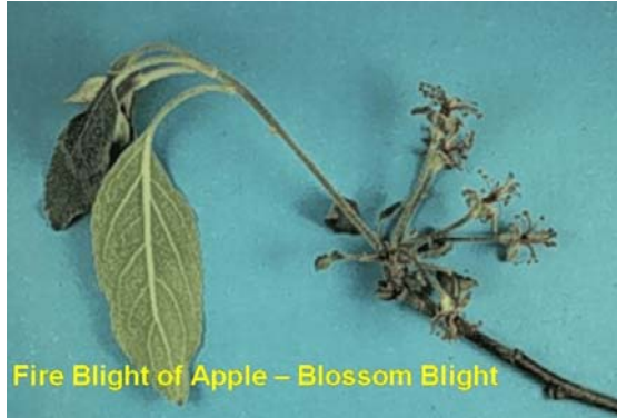
Fire Blight of Apple – Blossom Blight

orchard, including non-susceptible cultivars. Fire blight is most active during warm weather. Blossom infection is aggravated by showers which splash the blight bacteria. Labels for streptomycin call for application at 0.5 lb (or 0.25 lb plus 1 pt adjuvant Regulaid) per 100 gal dilute spray. The effectiveness of streptomycin can be increased by including the adjuvant Regulaid at the rate of 1 pint per 100 gal tank mix. Streptomycin remains effective for 3 to 5 days. For more information, consult the “Illinois Commercial Tree Fruit Spray Guide 2004” ( http://www.extension.iastate.edu/Publications/PM1282.pdf ). Also, detailed information on fire blight can be found at the web sites: http://www.ag.uiuc.edu/%7Evista/abstracts/a801.html , http://veg-fruit.cropsci.uiuc.edu/Diseases/Fire%20Blight.htm , and http://www.caf.wvu.edu/kearneysville/disease_descriptions/omblight.html .