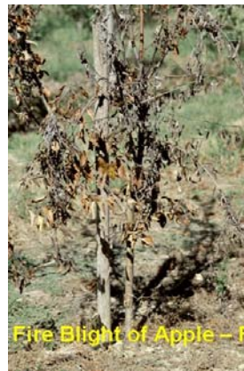
Fire Blight of Apple – Root Stock Blight