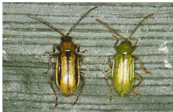
Western (left) and northern (right) corn rootworm beetles.

Western corn rootworm beetles resemble striped cucumber beetles because of the stripes on their elytra. The edges of these stripes tend blur or fade on the western corn rootworm, and they do not extend all the way to ends of the elytra. The underside of the abdomen of the western corn rootworm is yellowish. Northern corn rootworm beetles have no stripes and no spots ... they're uniformly yellowish green. These two species overwinter as eggs in the soil. Larvae that hatch in the spring feed on the roots of corn, then eventually pupate and emerge as adults, usually beginning in July. Western and northern corn rootworm adults undergo just one generation per year. The adults present in later summer and fall mate, and females lay eggs in the soil; those eggs overwinter to start the cycle again the next spring. These beetles feed on the silks of sweet corn and on the fruits of cucurbits.