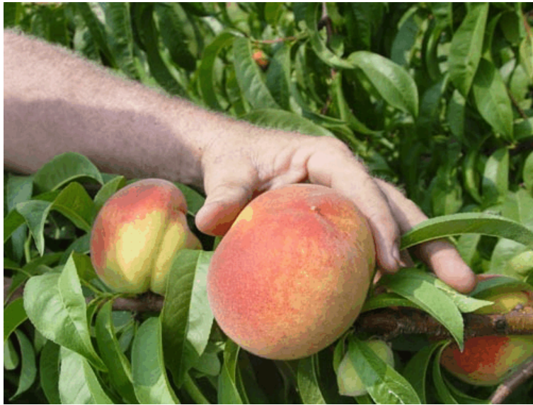
PF5 peaches ready for harvest

Grape growers are in the midst of canopy management, which includes vine combing, cluster thinning, and leaf removal. For the most part, disease has been at a minimum with all the hot dry weather. But with the rain recently, potential for disease development has increased and vineyards should be monitored closely. Black rot has already started showing up in some vineyards that have had minimal sprays. The hot dry weather has resulted in good conditions for mite development in many crops, and several growers have reported the need to spray for mites.