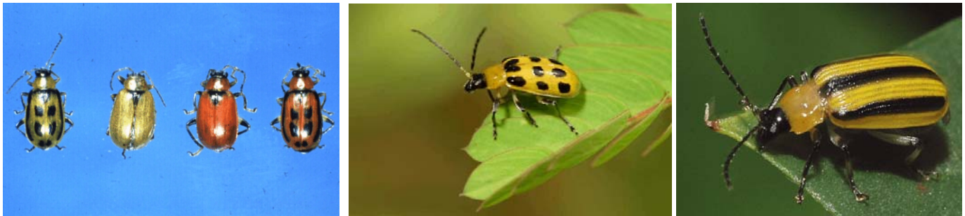
Left to right: bean leaf beetles, spotted cucumber beetle, striped cucumber beetle.

Bean leaf beetles vary in color and marking, some with black spots or bars on the elytra (shell-like forewings), and some without these marks. All are marked with a black wedge immediately behind the prothorax. Spotted cucumber beetles resemble bean leaf beetles but always have 12 distinct spots on the elytra. The front, center spots are distinct and do not form a triangle as they do on the bean leaf beetle. Striped cucumber beetles have distinct black stripes along the inner and outer edges of the elytra, and the stripes run all the way to the ends of the elytra. The underside of the abdomen is black. All of these insects overwinter as adults and move into fields and gardens in April through May, as soon as temperatures warm up and their food plants become available. They lay eggs at the base of their host plants, and larvae develop below ground, feeding on the roots. Two summer generations of adults of these species emerge and feed, mate, and lay eggs; adults of the latter of these summer generations overwinter. As spring adults of the striped cucumber beetle began to disappear in recent weeks in central Illinois, the first generation of summer adults has begun to build.