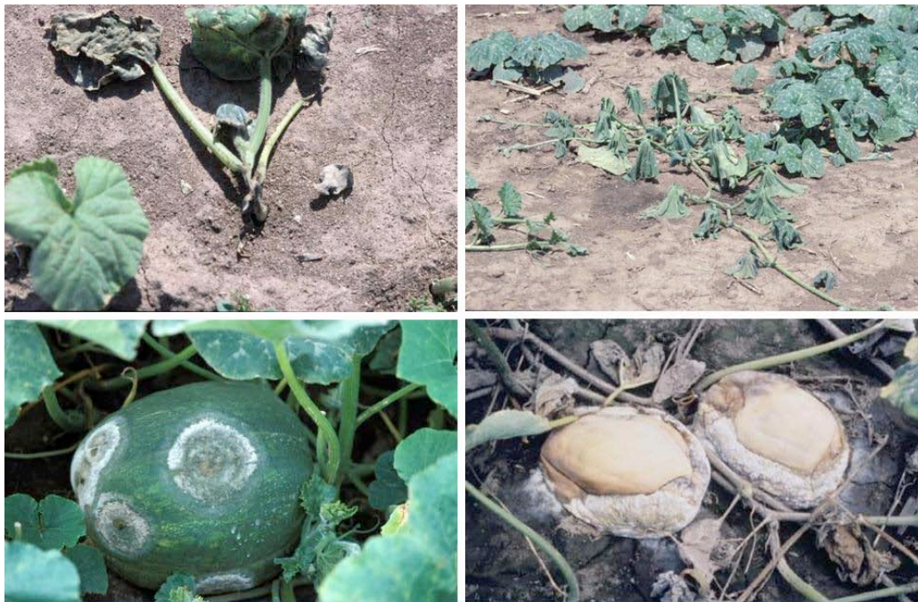
Pumpkin plant damping-off and fruit rot, caused by Phytophthora capsici

Phytophthora blight, caused by Phytophthora capsici , is a very important disease of cucurbits in Illinois. The pathogen can infect plants from the time of sowing seed until harvesting crop. An integrated approach with fungicide seed treatment, field scouting, and fungicide spray is needed to minimize damage of Phytophthora blight in the field. Seed treatment with Apron XL LS (0.65 fl oz/100 lb of seed) significantly reduces pre- and post-emergence seedling infection caused by P. capsici and Pythium species until about five weeks after sowing seeds. Field scouting, especially after major rainfall, and disking areas with localized infected plants, significantly reduces spread of the disease within the field. Applications of Acrobat 50WP (6.4 oz/A) or Forum 4.16SC (6 fl oz) plus copper sulfate (1.5 lb of Cuprofix Dispers Ultra 40DF/A) alternated with Tanos 50WDG (10 oz/A) plus copper hydroxide (1.5 lb of Kocide-2000/A), at weekly intervals, beginning first sign of the disease, can effectively suppress development and spread of the disease. For information on Phytophthora of cucurbits, refer to http://www.ag.uiuc.edu/%7Evista/abstracts/a945.html .