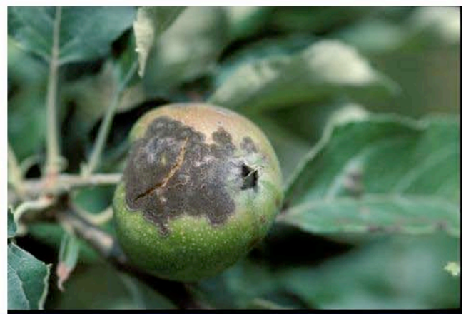
Apple scab, leaf and fruit infection