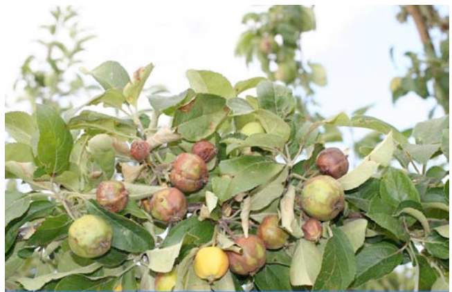
Apple shoots infected with fire blight bacterium (Illinois - June 2006)

Apple Scab: More than expected scab infection has been observed in apple orchards in Illinois in 2006. Apple scab, caused by the fungus Venturia inaequalis , is basically a spring-season disease in Illinois. The pathogen overwinters in the leaves on the ground and the spores are mature and disseminated at early bloom. Therefore, control of early season scab (primary scab) of apple is essential. There are several fungicides (i.e., Topsin-M, captan, mancozeb, Polyram, Syllit, Vanguard, Scala, and more) that effectively control apple scab. For more information on control of apple scab, consult Illinois Commercial Tree Fruit Spray Guide 2006” ( http://www.extension.iastate.edu/Publications/PM1282.pdf ). Also, additional information on apple scab is available at websites: