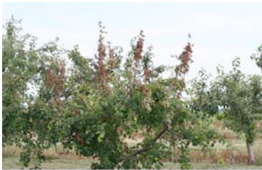
Apple shoots infected with fire blight bacterium (Illinois - June 2006)