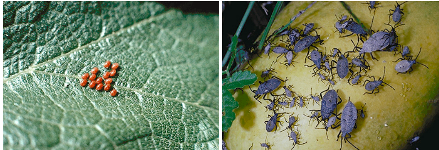
Squash bug adult (above), eggs (lower left), and nymphs (lower right).

Late June and July usually bring the beginning of squash bug infestations in Illinois. The squash bug, Anasa tristis (De Geer) (Hemiptera: Coreidae), is a perennial and severe pest of pumpkins and squash; it rarely injures cucumbers and melons in the Midwestern United States.