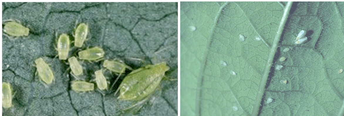
Left: green peach aphid colony. Right: greenhouse whiteflies.

In cucurbits, Thiodan (endosulfan) and Capture give some control, but thorough coverage of upper and lower leaf surfaces is essential (as it is for all insecticides used for aphid control except for systemic products). Dimethoate is labeled for use on melons for aphid (and mite) control, but its use on other cucurbits is not legal. Malathion, Diazinon, and Lannate are somewhat effective. Newer insecticides labeled for aphid control in cucurbits include Fulfill (pymetrozine) and Actara (thiamethoxam). In peppers, Assail, Orthene, Dimethoate, Thiodan, and Provado are labeled for aphid control; all are fairly to very effective. Platinum and Fulfill are newer products registered for aphid control in peppers. In addition, an older organophosphate, Metasystox-R (now sold as MSR Spray Concentrate by Gowan), is still labeled and effective for aphid (and mite) control on peppers and cucurbits. For organic growers, insecticidal soaps such as M-Pede are the best bet, though thorough coverage of leaves is especially important for soaps.