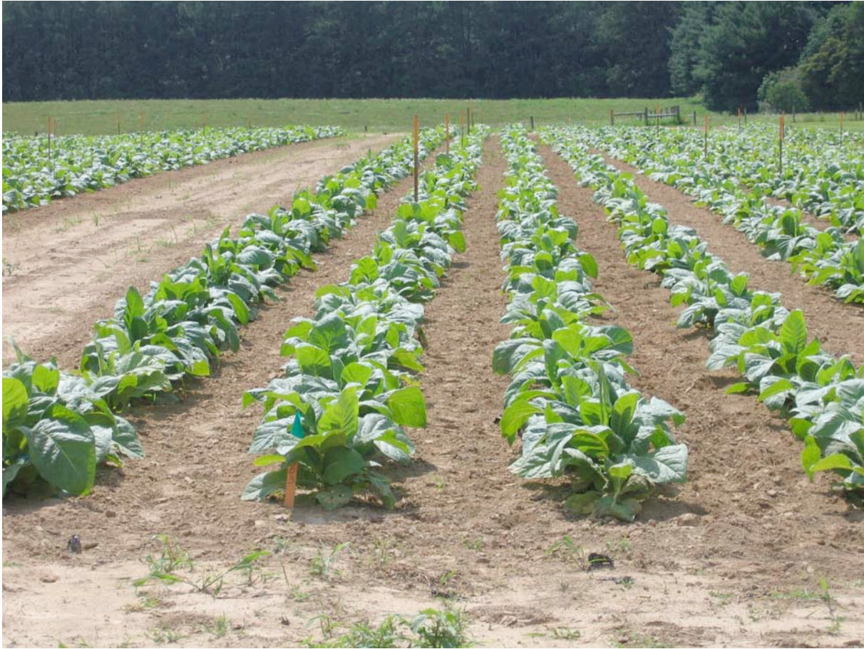
Tobacco plots at the Dixon Springs Agricultural Center.

The tobacco crop at DSAC is looking good at this time. Yes, tobacco ... this is a nitrogen fertility study being conducted in conjunction with the Crop Science Department here. Last week the crop received side-dress nitrogen treatments, and it has since been cultivated and is growing well.