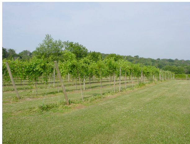
Northern Illinois Winegrowers Experimental Vineyard, Galena

Perhaps the fastest growing segment of the specialty crop industry in Illinois is the grape industry. While a few acres of table grapes can be found, the vast majority of acreage of grapes in the state, more than 1200 acres, is wine grapes. The development of this industry began in the late 1980's, with rapid growth beginning in the late 1990's. Several surveys of this industry have been conducted, with the most recent in 2007. Reports on those surveys are available from the Illinois Grape Growers and Vintners Association at their website, www.illinoiswine.com .